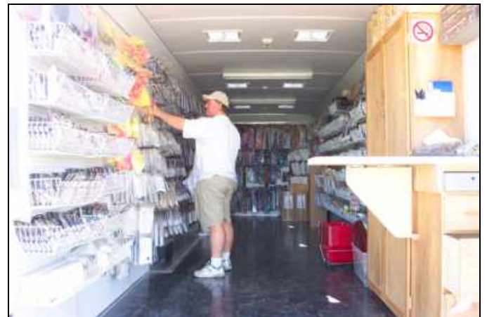
WHAT'S UP HOBBIES NEW RIG